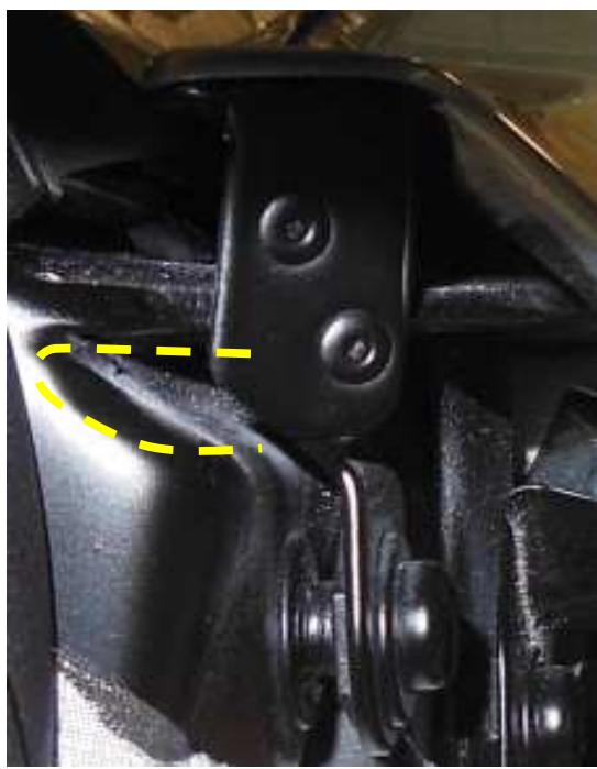
5. Apply the paper tape in order to mask the surrounding surfaces of the Area to be sealed.